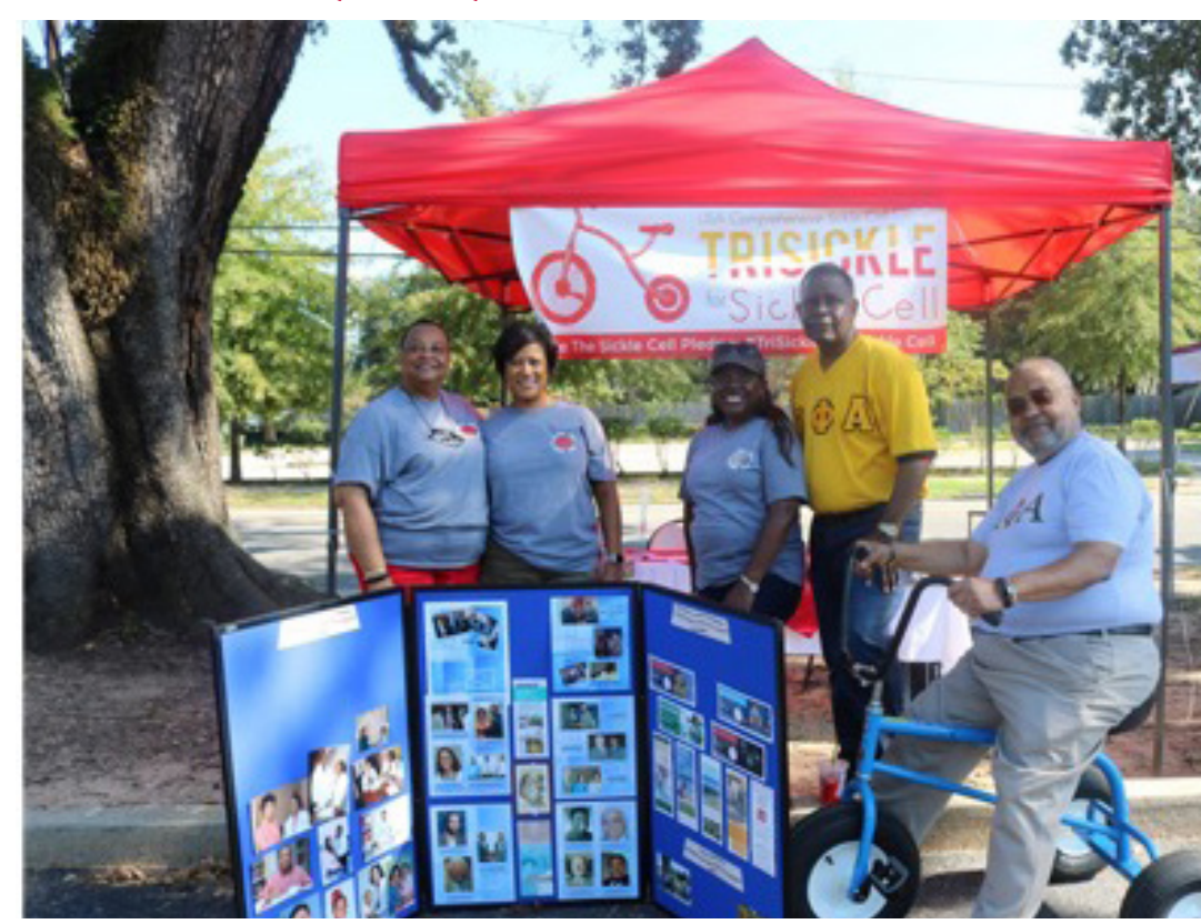
TRISICKLE for Sickle Cell Campaign

As a result of mandatory newborn screening, penicillin prophylaxis, and pneumococcal vaccines, the life expectancy of babies born with sickle cell disease (SCD) in the United States has improved to the 4th and 5th decades of life. While survival with SCD has improved, onethird of adolescents and young adults delay or do not successfully transition to adult care and are lost to medical followup for the management of their SCD and