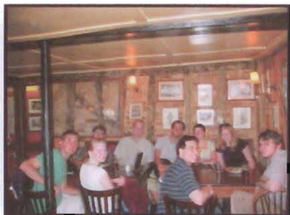
At lunch in the Eagle pub in Cambridge, where the pilots of World War II relaxed