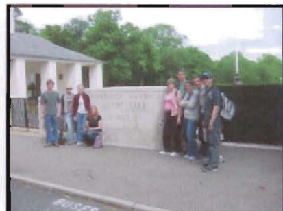
The class at the American Military Cemetery in Cambridge