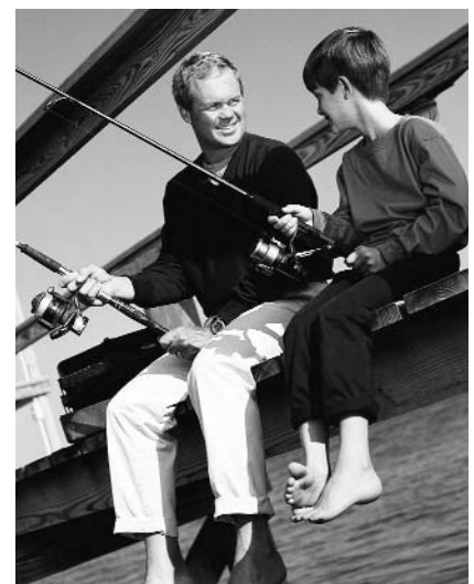
Enjoy the lazy days of summer and learn the basics of fishing.

09UHM655AG, 6/10/2009 - 6/20/2009 3 Sessions, W from 6:00 PM to 8:00 PM 0.8 CEU, $35 Fee for children is $25