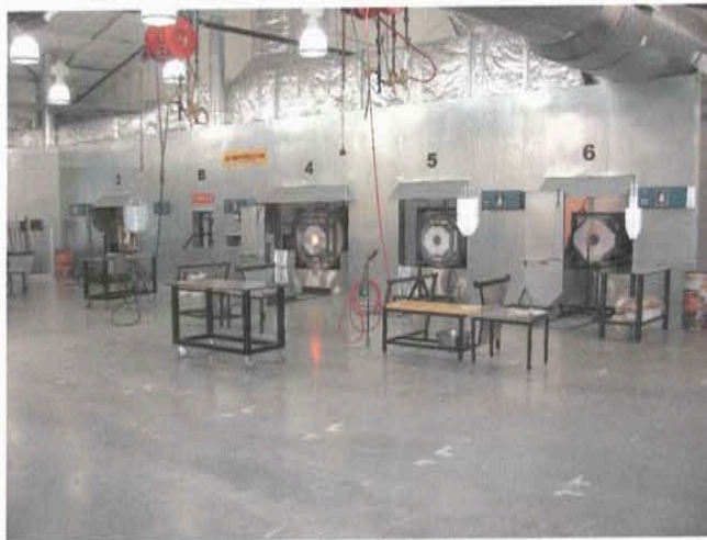
Model for Interior