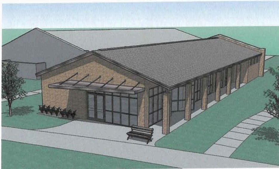
New Facility for Glass Program (Preliminary Rendering)