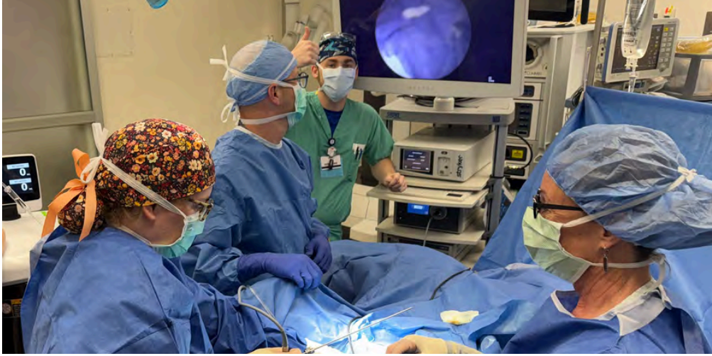
Urology faculty and residents work together to care for a pediatric trauma patient.