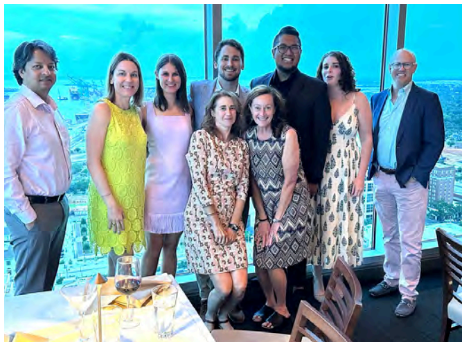
The team enjoys a dinner at Dauphin's restaurant in downtown Mobile.