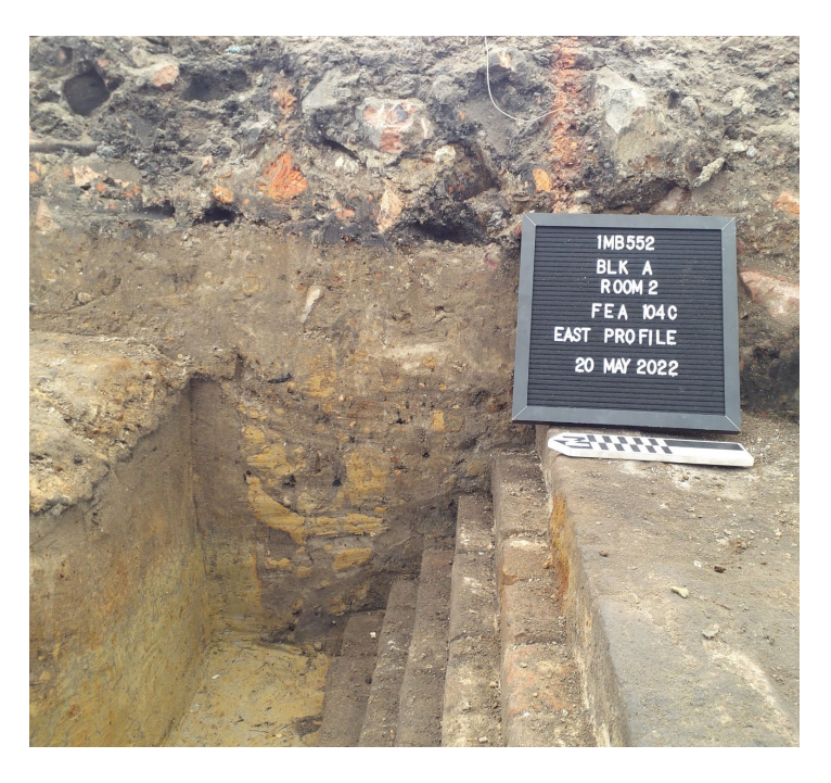
Redug builder's trench within original builder's trench between Rooms 2 & 3.

Excavations of wall features revealed episodes of remodeling and repairs. Evidence of repairs were identified along the exterior walls, possibly the result of hurricane damage. At some point, Room 3 was converted to exterior walls and that conversion is identifiable in the wall trenches and brick construction.