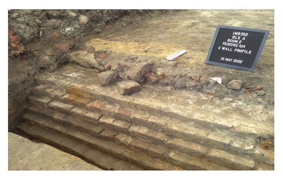
Feature 104, one of the brick walls separating Rooms 2 & 3.

The remains of an in situ wood floor was found beneath the demolition rubble. Intermixed were plaster and mortar, as well as some possible structural cross beams that likely fell from the ceiling when the building was demolished.