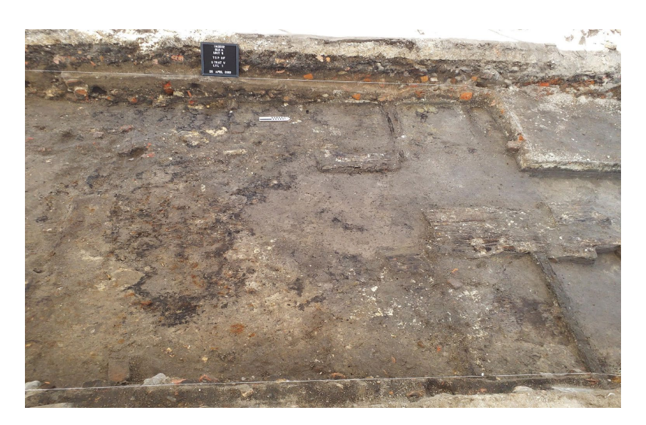
Rooms 5 & 6 at the interface of the wood floor and subfloor.

All of the brickwork is spread footing with a spread of coarse shell since the building is constructed on the former Mobile River marsh, a sandy substrate that is frequently inundated by the water table. The shell likely helped prevent settling of the building.