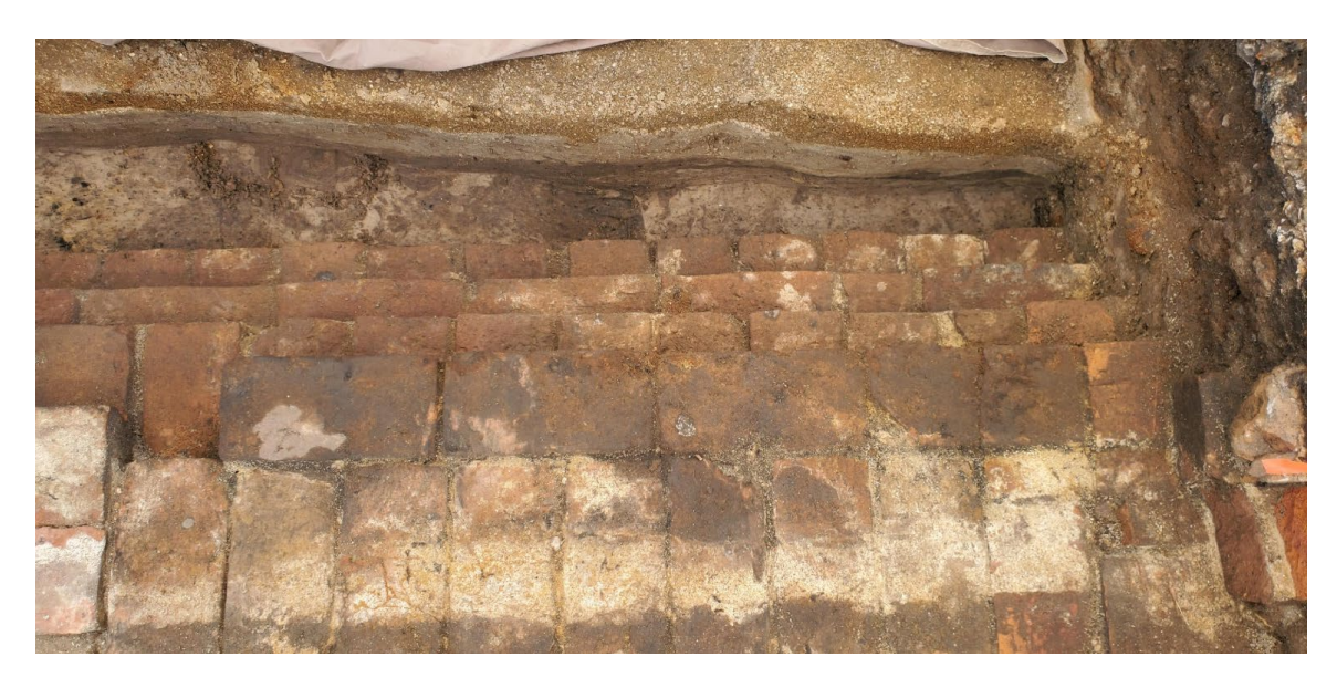
Feature 133 with crushed shell lining the Feature 104 builder's trench, possibly to prevent sinking in the sand and water table.