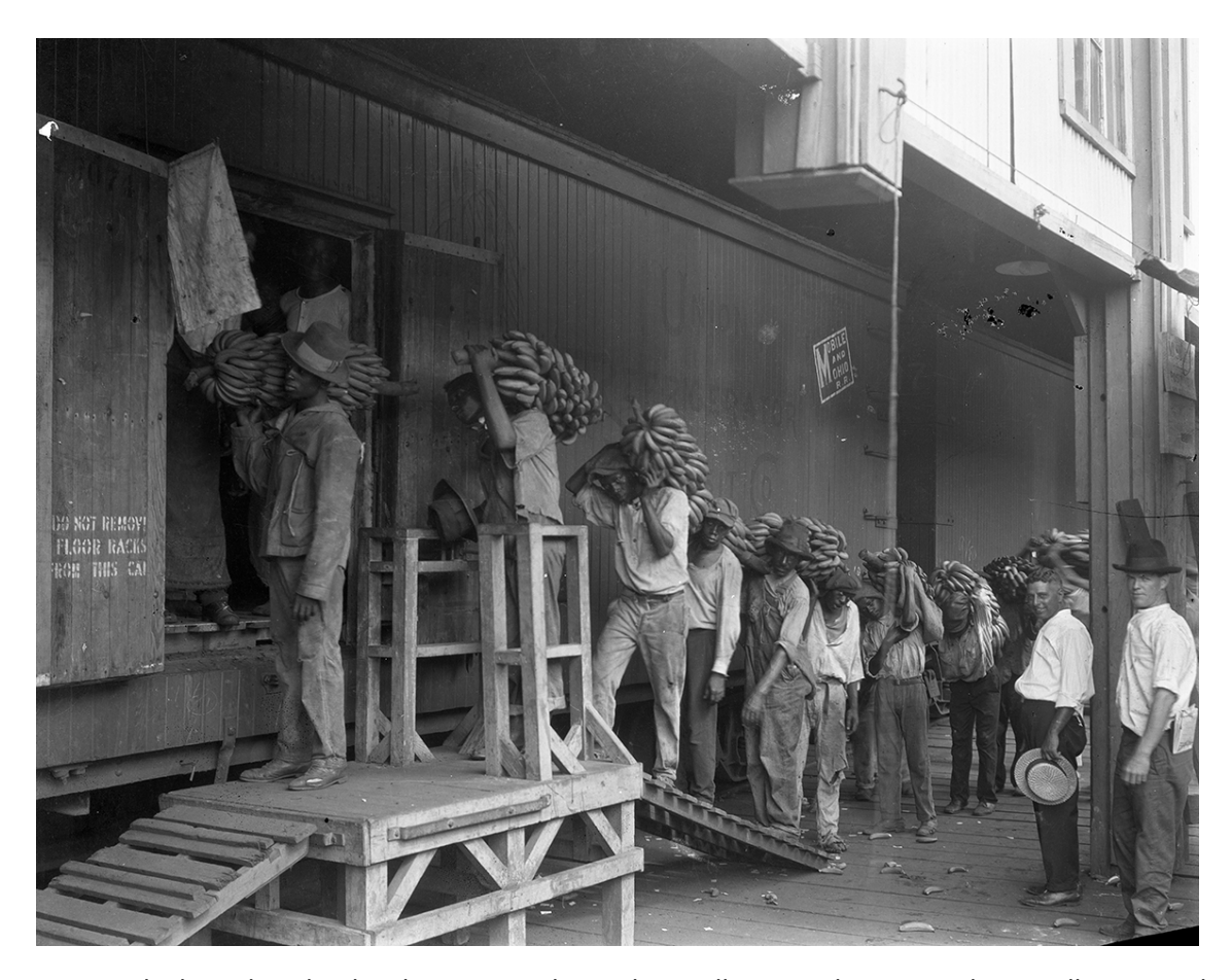
Banana dock workers loading bananas.