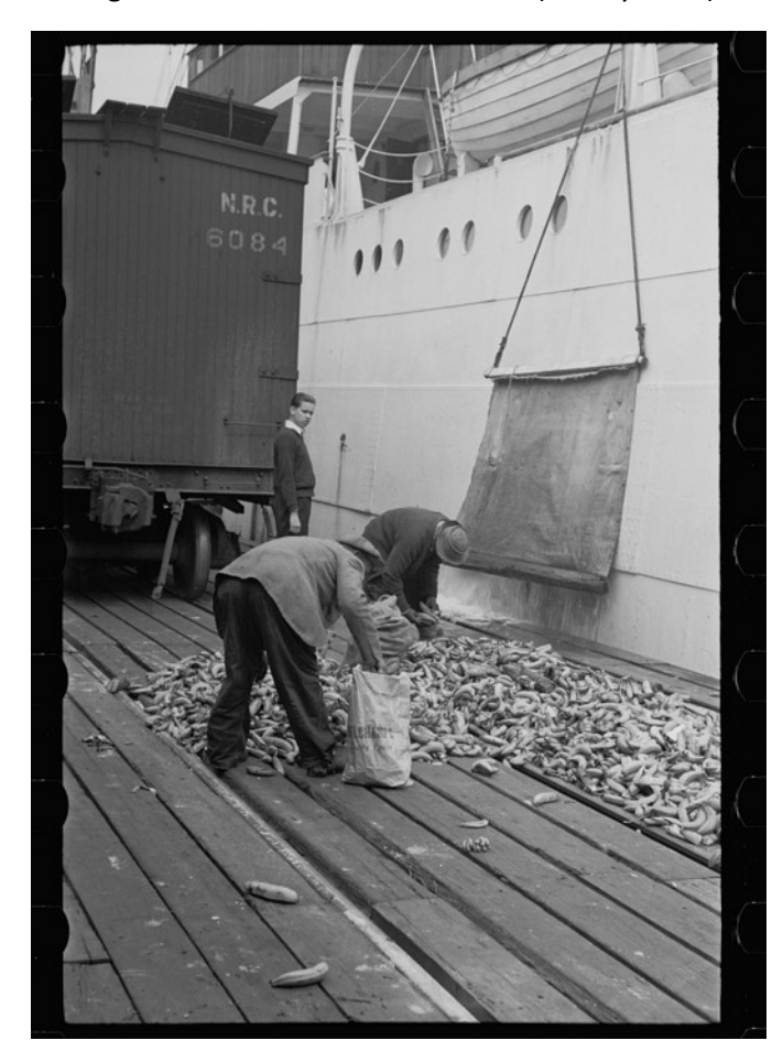
Banana Docks fruit spoilage pile

The Mobile Banana Dock's were a large open-air city market constructed in 1857, six blocks north-northeast of site 1MB564. Historic maps and directories show this neighborhood, known as Down the Bay, was first settled in the late-1800s. The market, historically called the Banana Docks, was associated with The Port of Mobile; of which brought large shipments of fruits and vegetables from southern regions of the world. In the early 1900s, The United Fruit Company docked their boat fleets at the Banana Docks where primarily black migrants would gather for a daily wage unloading, counting, and sorting bananas from boats to railcars (Pinney 1989).