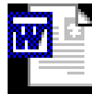
Microsoft Word Document

The standards from the lesson are taken directly from the Alabama Course of Study. I have also included a list of cognitive skills that I believe are exercised through the completion of the various tasks. Please click on the icon below to view these standards.