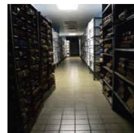
University Archives Stacks

records should reflect the activities of the league from its establishment in 1925 as the Mobile Charity League up to today. The gift of the Junior League's records further builds on the women's collections already housed at USA Archives, including those of the Woman's Clubhouse Association, the Forum Club, the Wistaria Study Club, and the Azalea City Quilter's Guild.