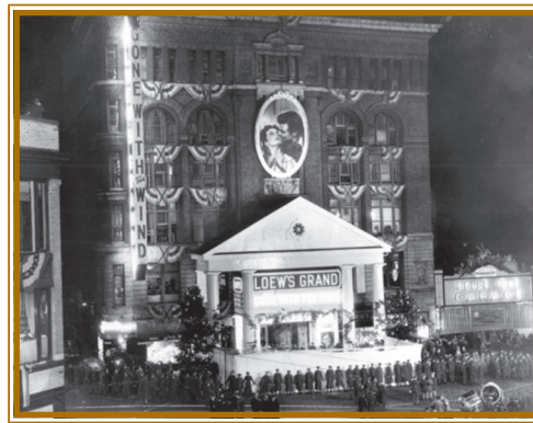
GONE WITH THE WIND OPENING NIGHT AT THE LOEW'S GRAND THEATRE, ATLANTA GA. 1939