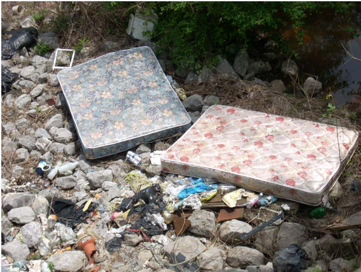
Figure 2- Todd Acres Dr. at Rabbit Creek

The results from the county sites were a bit more dramatic as all 5 sites showed clear evidence of illegal dumping. B3 had the least amount of debris of any county site. There was evidence of some dumping of household trash and a microwave oven was also found. B4 had a large amount of household garbage scattered around the bridge and a piece of a television. There were also numerous plastic jugs for things like oil and bleach scattered nearby. B1, B5, and B2 contained the greatest amounts of debris as well as the most variety. Some of the things found at all three sites include animal carcasses, electronic equipment, tires, household trash, furniture, plastic chemical jugs, plastic bags, styrofoam, and wood.