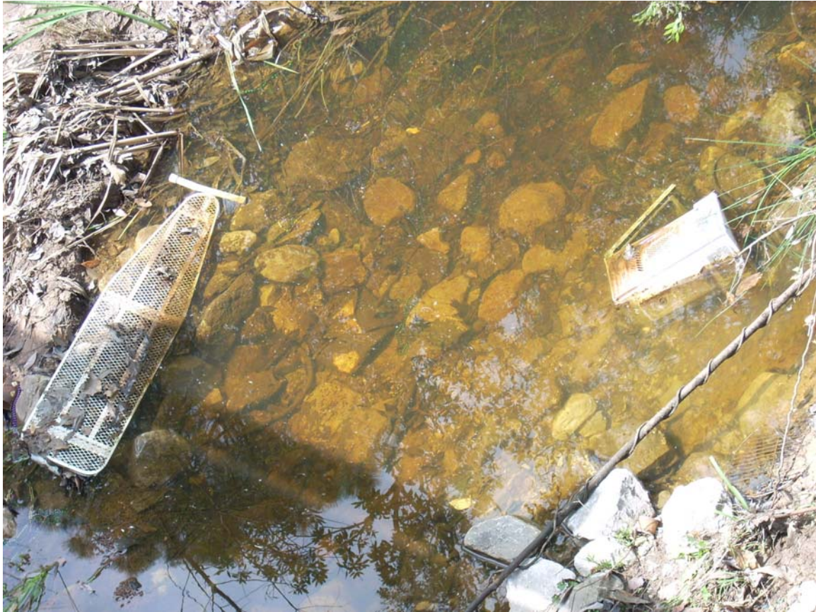
Figure 3- Microwave dumped in Rabbit Creek

or disposed of, or otherwise managed” (State of Alabama 1975). The EPA has not yet declared e-waste hazardous material although I think it qualifies.