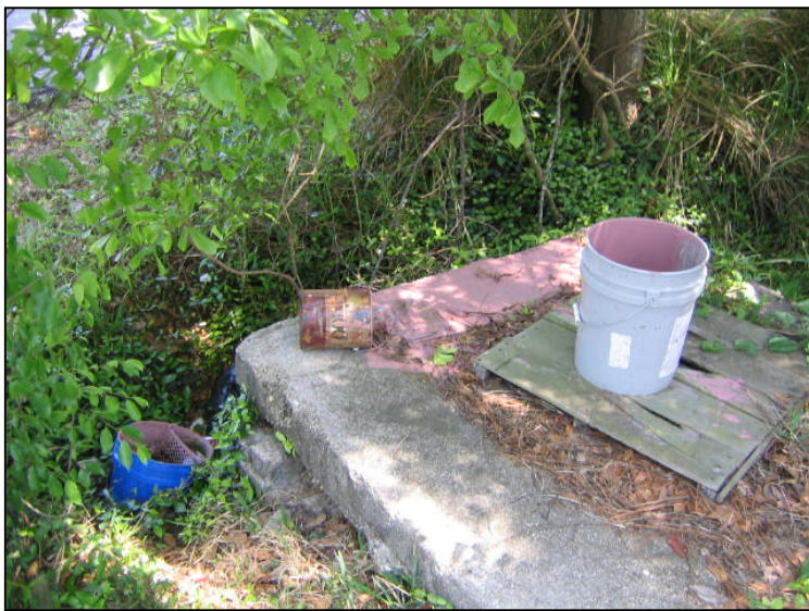
Figure 4: Paint dumped along the Montlimar Canal Greenway

The City of Mobile has failed to promote the Montlimar Canal Greenway because of a lack of funding (Pickett 2005). In order for the greenway to be successful the city