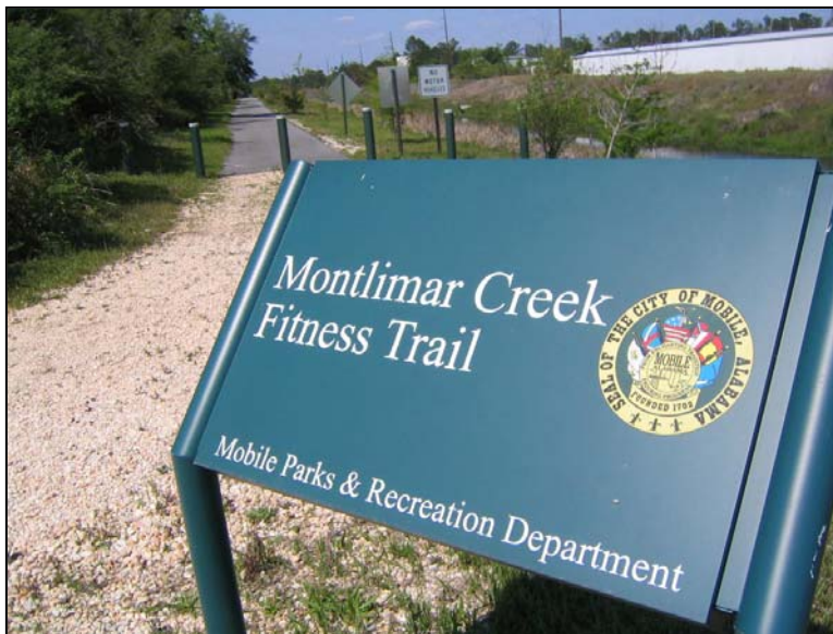
Figure 2: South end of the Montlimar Canal Greenway

Unfortunately, the Montlimar Canal Greenway (Figure 2) was the only segment of the Green Spaces Master Plan to be completed. The original concept of the one-mile