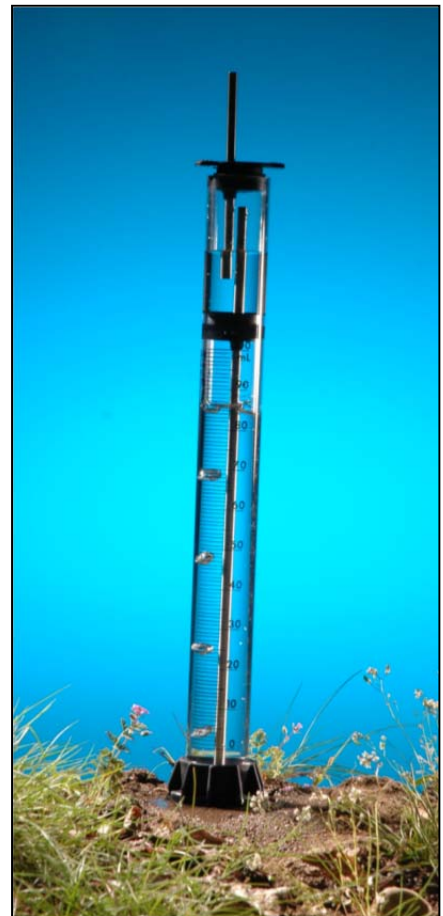
Figure 2: Picture of an Infiltrometer

A mini disk infiltrometer, a device that measures infiltration rates, was used to collect measurements of the infiltration rates of the ground in our research areas. (Figure 2) For each observation, the infiltrometer was filled with water to a given height and the suction head was set to 2 cm. When the water-filled infiltrometer is placed on soil, the soil creates a natural suction action that absorbs the water from the infiltrometer over time. (Weight, 2008) The amount of water loss from the infiltrometer was recorded every 30 seconds using a stopwatch. The type of soil directly under the infiltrometer was also recorded. Four measurements were taken in each of the three research areas over a two-week period.